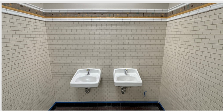
Wall tile is complete in the restrooms and plumbing fixtures are being installed.