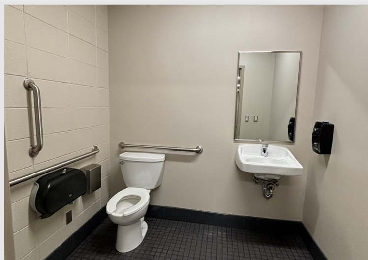
The new restroom is ready for everyday use!