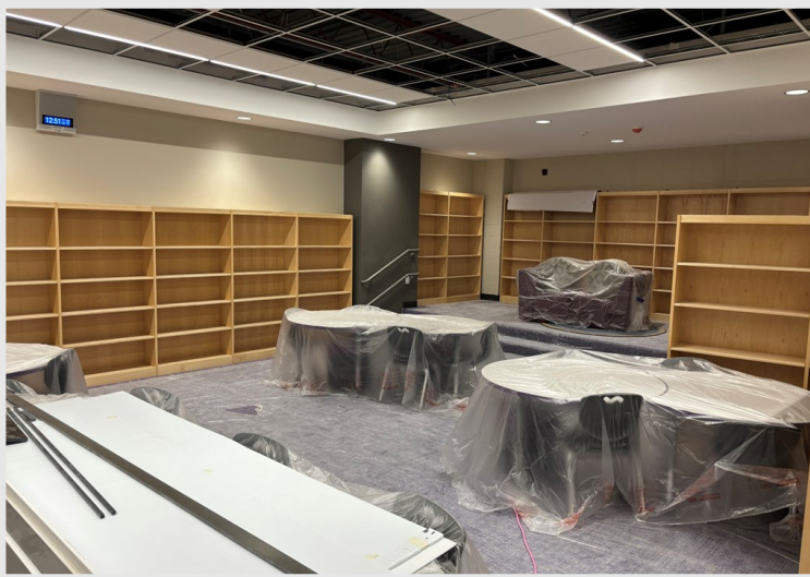
Library flooring has been installed and the school district has moved in furniture for the start of the school year!