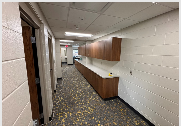
Casework and flooring installed in the office passage.