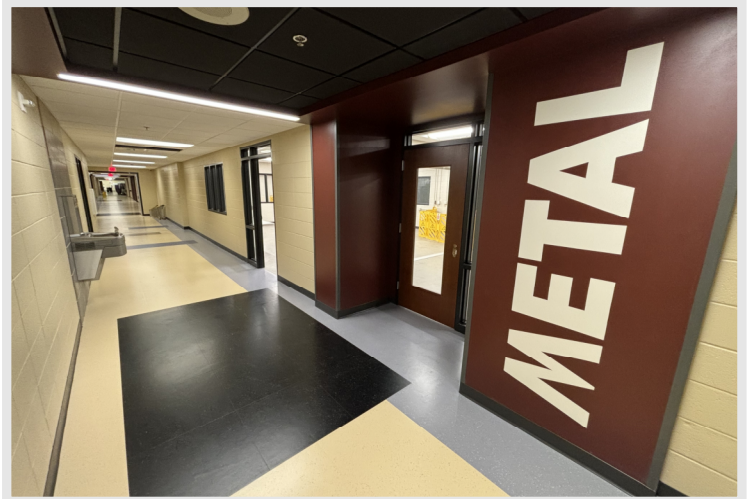
A look at the new entrances to each of the Shop Classroom spaces with names stenciled proudly on the face.