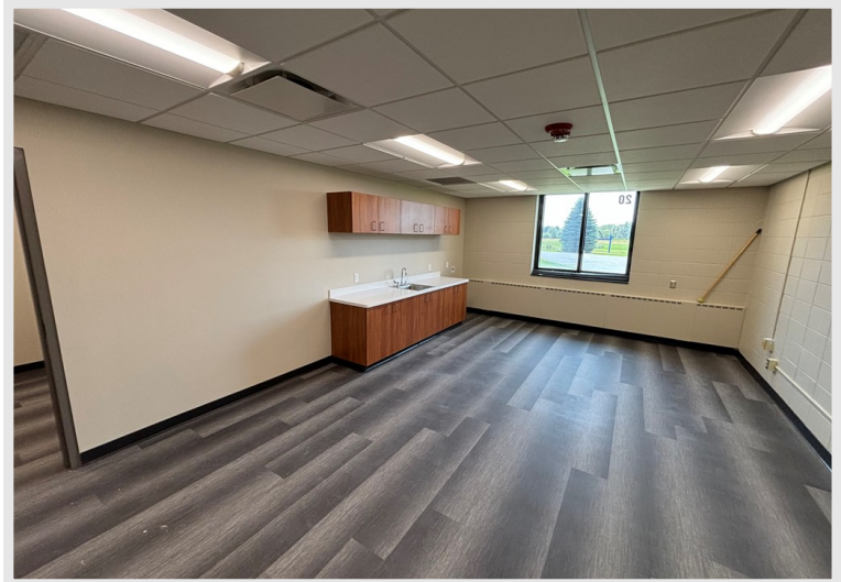
New casework and flooring installed in the lounge.