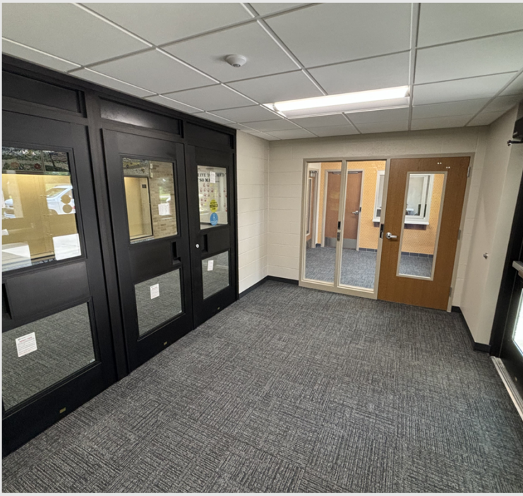
The new vestibule at the main entrance with its key fob system to enter the building.

618 Bakertown Rd. • Jefferson, WI PAGE 4