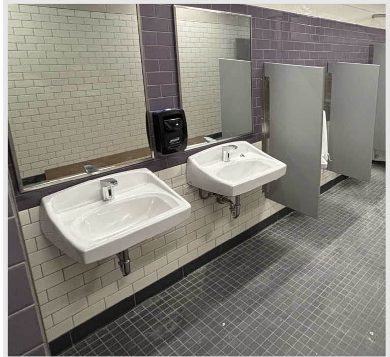
Plumbing fixtures and toilet partitions have been installed in restrooms.