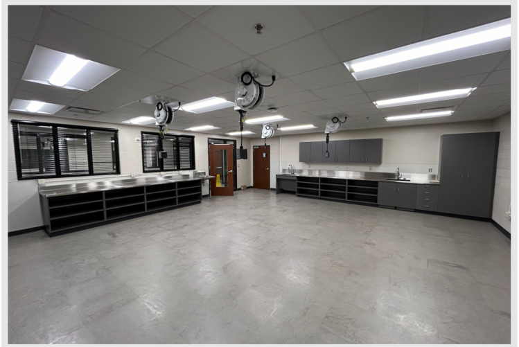
Casework, flooring, and ceiling tile is all installed in the Food Lab.